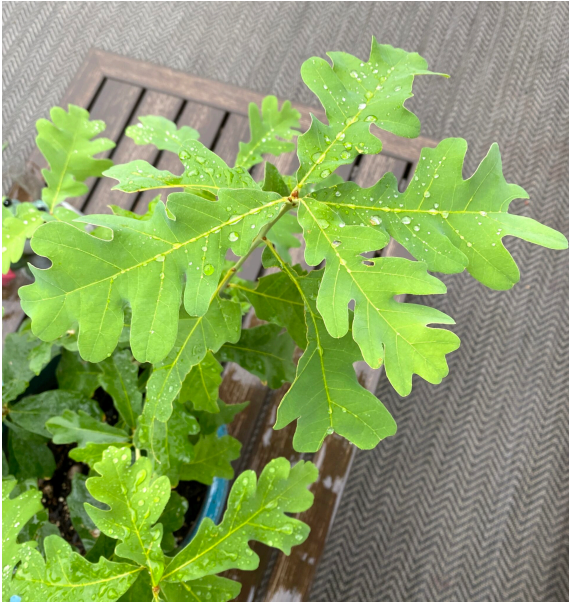
Leaves intercept water to help with stormwater management and cooling.

Trees use or lose water by two separate processes. First, water is taken up by tree roots from the soil and evaporated through the pores or stomata on the surface of leaves. Transpiration is a physiological process responding to soil and atmospheric factors. It is a passive movement of water through the tree system which allows columns of water to move great heights. Water movement through a tree is controlled by the tug-of-war between water availability and water movement in soil versus water loss from leaves. For example, water movement in a ring porous tree like a red oak is 92 ft/hr, in a diffuse porous tree like a basswood is 11 ft/hr, and for a pine tree is 6 ft/hr. Trees can absorb between 10 and 150 gallons of water daily, yet of all the water absorbed by plants, less than 5% remains in the plant for growth. They rely on available water in the soil to "rehydrate" during the nighttime hours, replacing the water loss during the daytime hours.